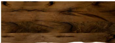
Barkline front and square back