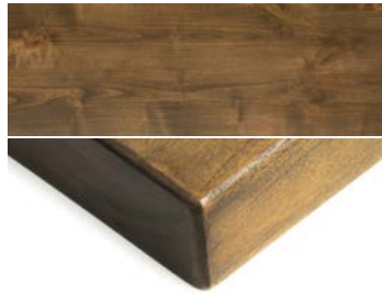
Knotty Alder (Dark)