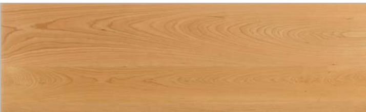
Cherry solid wood - after aging