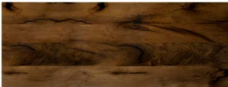
Square front and back