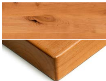
Knotty Alder (Natural)