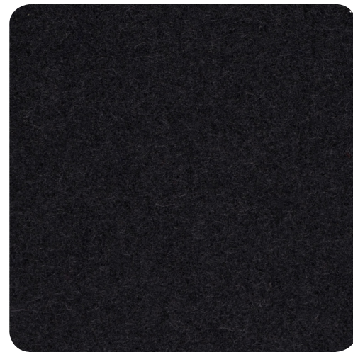
Black (60999) Nordic Wool