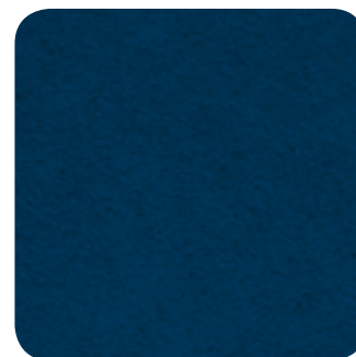
Commodore Blue (6503)