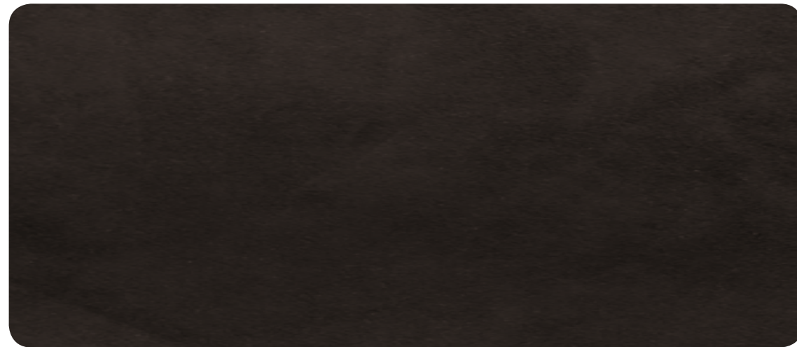
Black (9400) Alcantara