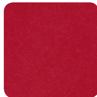
Goya Red (3096)