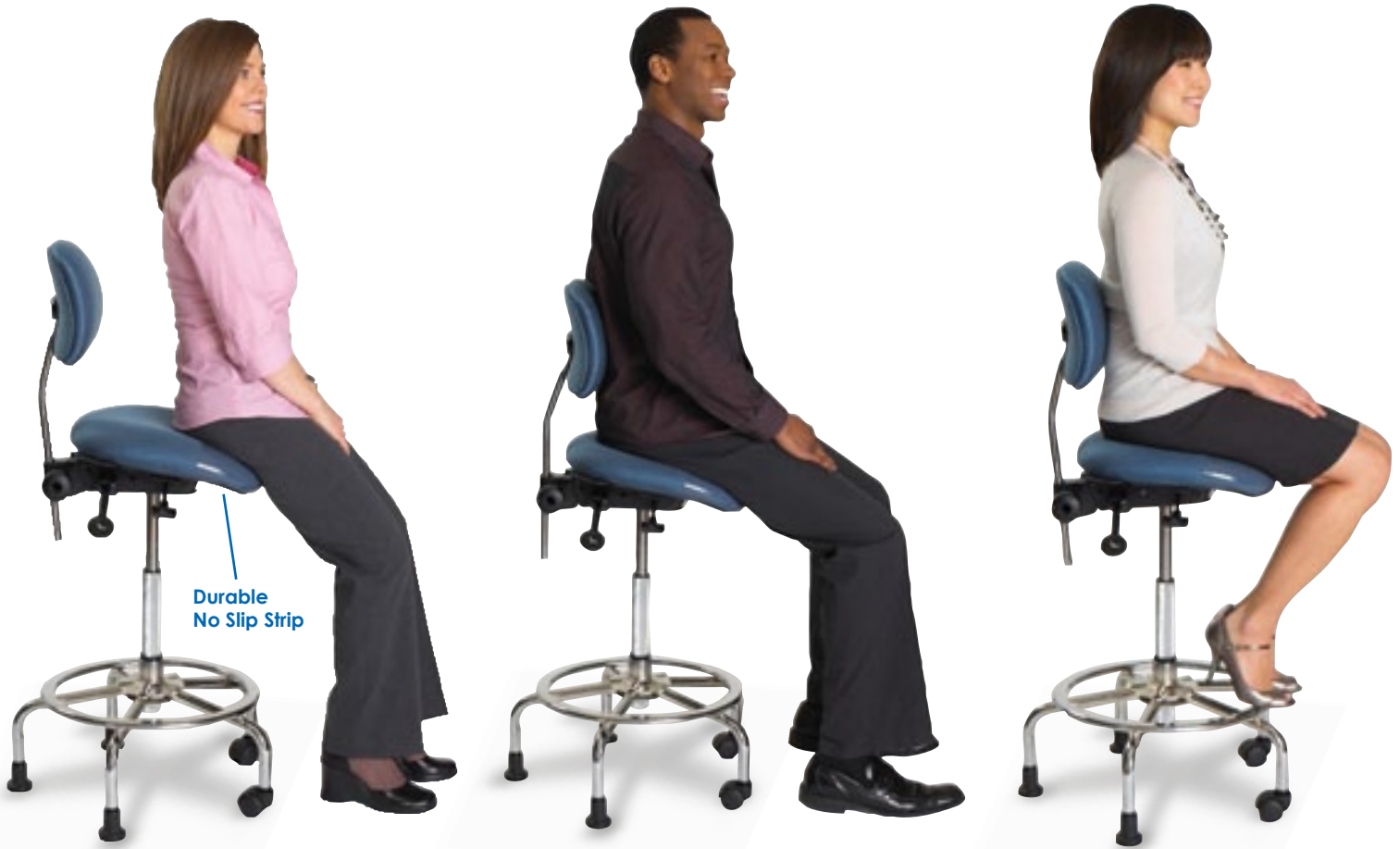
As a Sit Stand