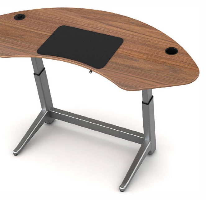
Locus Sphere Desk shown in Black Walnut