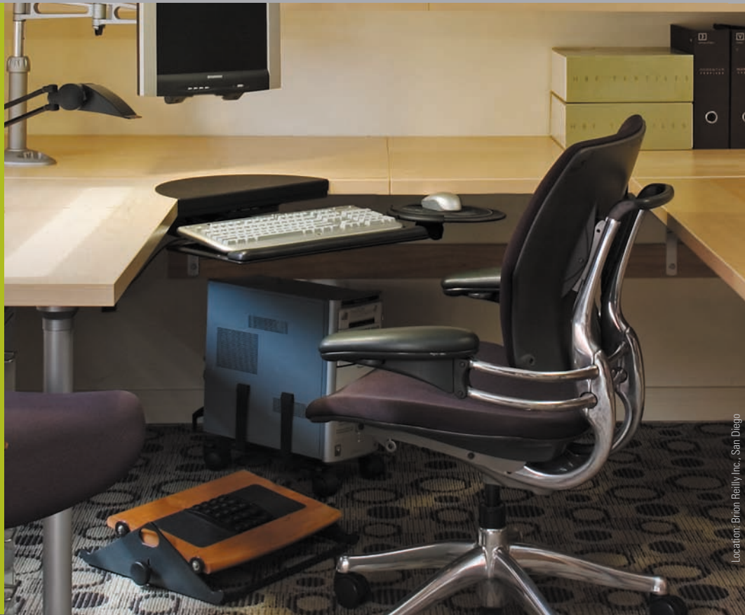
Location: Brian Reilly Inc., San Diego

A highly ergonomic work environment is built around four primary tools—task chair, articulating keyboard/mouse support, adjustable monitor arm and task light—that work together to improve the health and comfort of computer users. The absence of any one of these four tools may impact the ergonomic benefits of the others, whereas additional components, such as foot rests, can further improve the workstation's ergonomics. To better understand how the ergonomics leader can dramatically improve your workday with the right assessments, tools and training, contact your Humanscale representative.