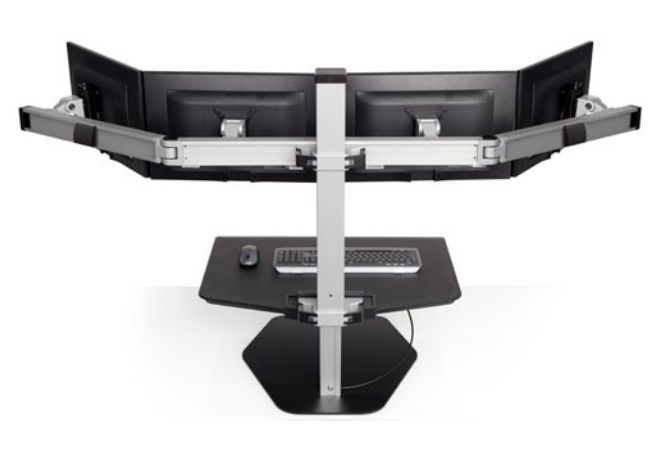
Engineered for stability.