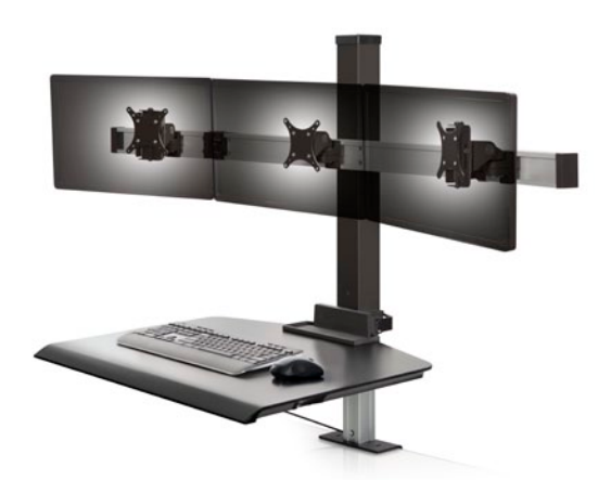
Customize your Winston from the various finish and mounting options available.