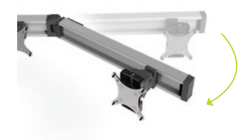
Position monitors flat or in an arch with easy to adjust hinges.