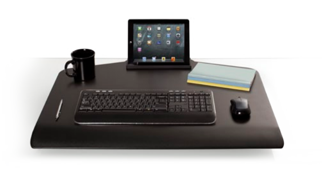
Expansive work surface features a storage tray —keeps items within reach.