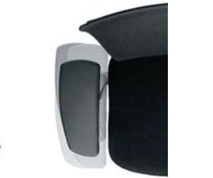
High performance arms easily adjust to support you and your task with 4" height, 2.5" width and 3" fore and aft movement