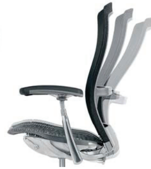
Synchronized recline with auto-balanced tension adjusts effortlessly using your body weight as a counterbalance