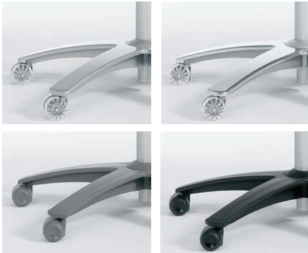
Base and caster options, clockwise from top left: painted matte aluminum base with clear casters; polished aluminum base with clear casters; black plastic base and casters; grey plastic base and casters