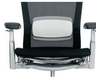
Optional adjustable lumbar is made with slow-recovery foam and attaches magnetically to the BSF