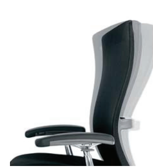
Flexing back frame follows your movements and ensures constant full back support

Life was designed using international ergonomic guidelines to fit 95% of the population and works well in collaborative areas and open plan environments, shown at left with Blackout BSF and Eclipse/Blackout Knitted Seat Topper (KST) in an AutoStrada workstation.