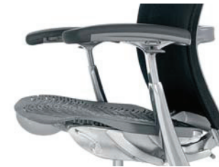
Flexing seat pan alleviates pressure points, allows for proper circulation, supports perched postures and eliminates the need for thick foam upholstery