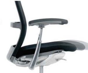
Adjustable seat depth provides ample 4" range for various body types