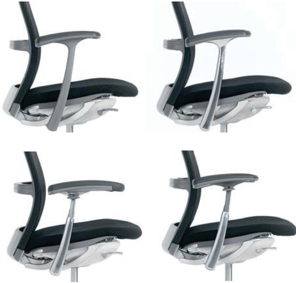
Arm options, clockwise from top left: fixed plastic arm; fixed aluminum arm; height adjustable arm; and high-performance arm