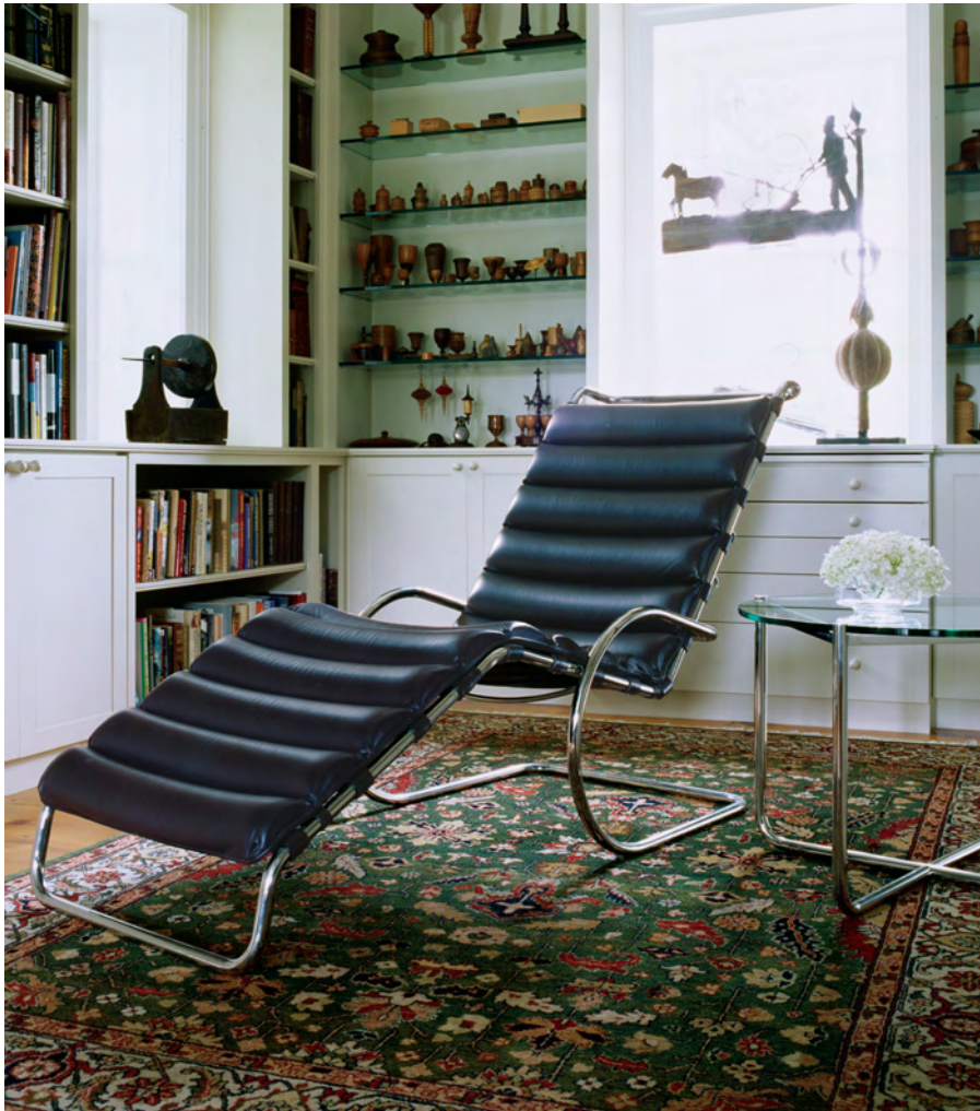
BKS148R © 2006 Kravet, Inc.

LUDWIG MIES VAN DER ROHE "Architecture is a language, when you are very good you can be a poet," wrote the acclaimed architect and Bauhaus director. As a leading Modernist architect and furniture designer, Mies elevated industrial-age materials to an art form. His steel-framed buildings with large-scale glazing, like the Seagram Building in New York (1958) and the Nationalgalerie in Berlin (1968), are landmarks of Modern architecture.