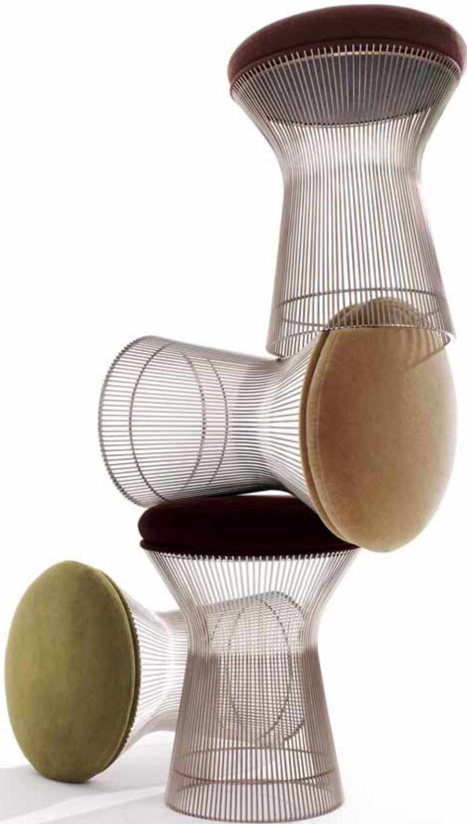
Stools, above, with Polished Nickel finish in Spinneybeck Maremma leather, Medici; Knoll Velvet, Sandstone; Knoll Velvet, Mink; and Spinneybeck Maremma leather, Rocco Pisana. Right, Dining Tables, Arm Chairs and Stools with Polished Nickel finish. Seating upholstered in Cato, Fire Red.