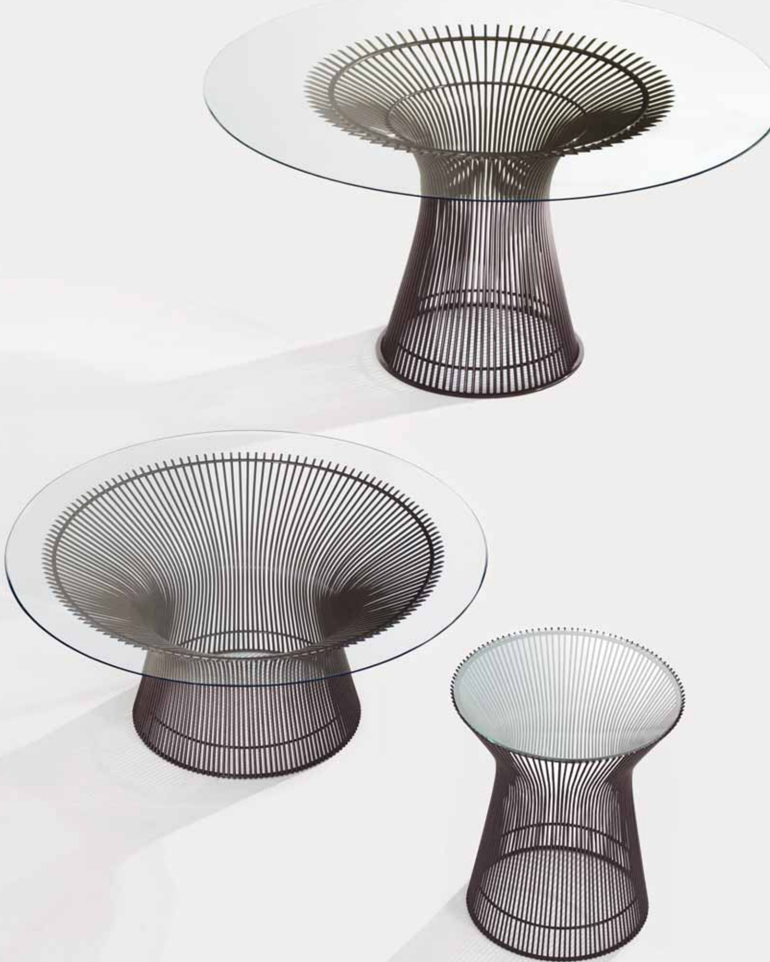
Dining, Coffee and Side Tables with Bronze finish and Clear Glass tops.