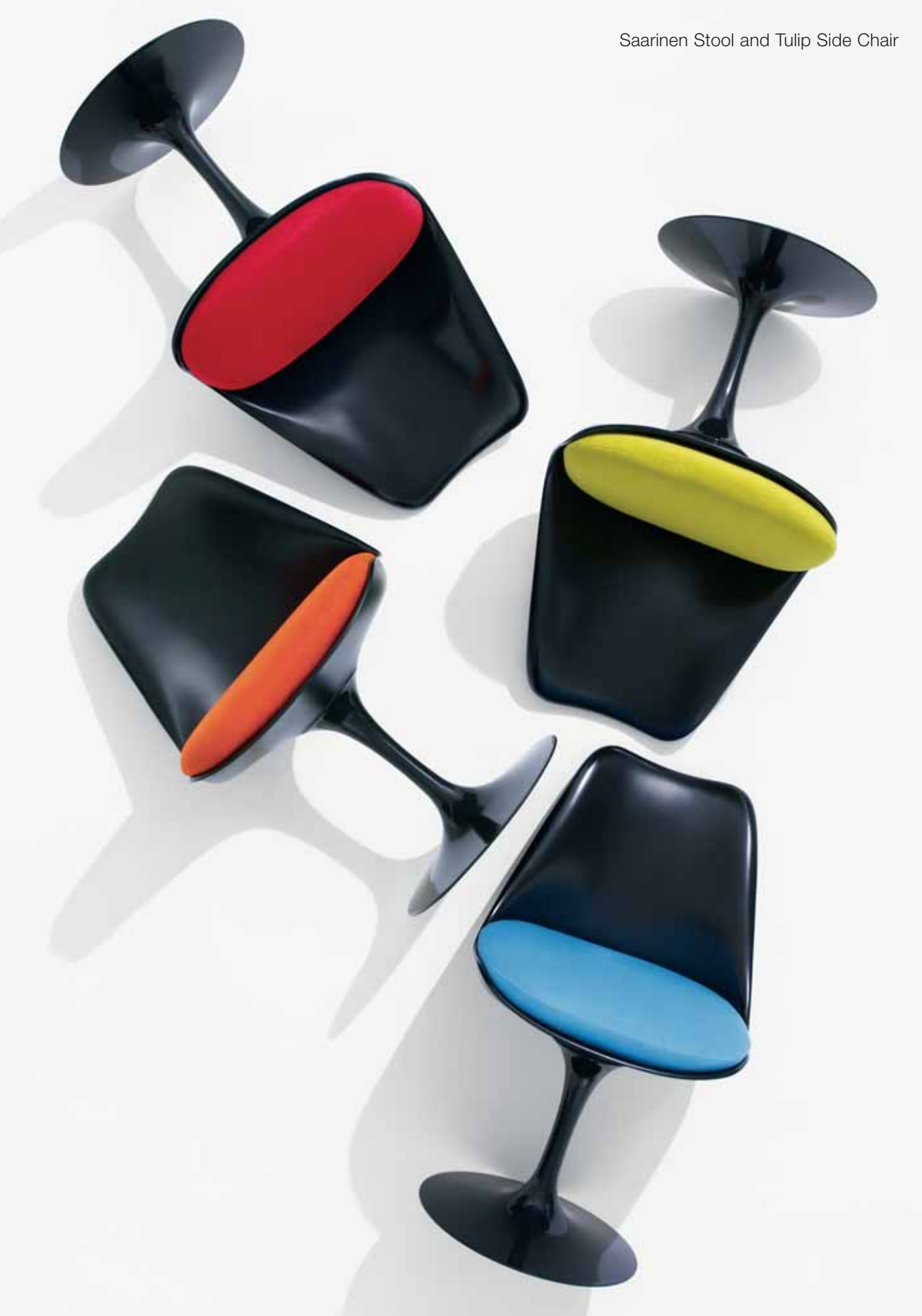
Stools, left, and Tulip armless chairs, shown above, with seat cushions in Ultrasuede, Flannel, Green Tea, Placid and Poppy.