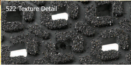
Available Colors: Black, Black-Yellow