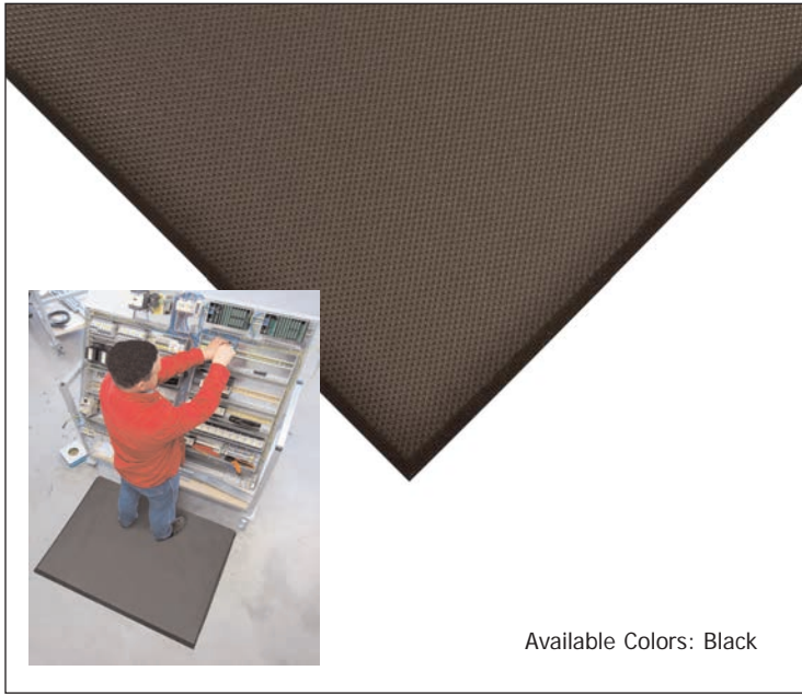
Available Colors: Black

Superfoam ® is an extremely lightweight anti-fatigue mat designed especially for ease of handling and ergonomic comfort. Made from a closed cell PVC Nitrile foam blend, Superfoam ® is highly resistant to greases, oils, animal and vegetable fats. This allows it to be used in areas where occasional overspray and dripping occur such as dishwashing stations and bar areas. And because of its light weight, it is the perfect mat for areas where mats are regularly moved for cleaning like cooking lines, service counters, and food prep stations.