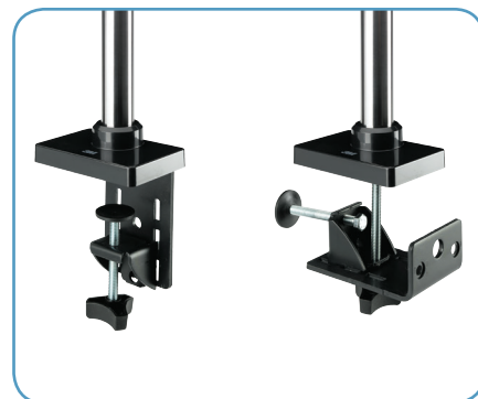
Clamp and grommet mount on desk mount model