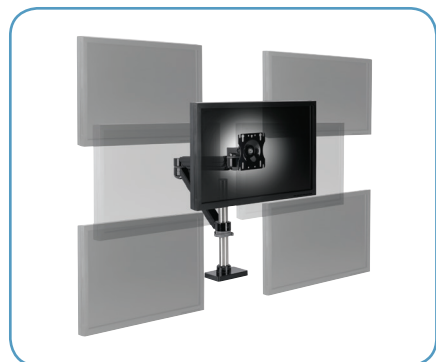
Highly adjustable arm