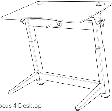
Locus 4 Desktop