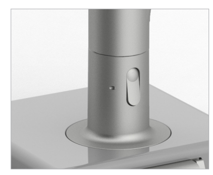
Quick Release Joints