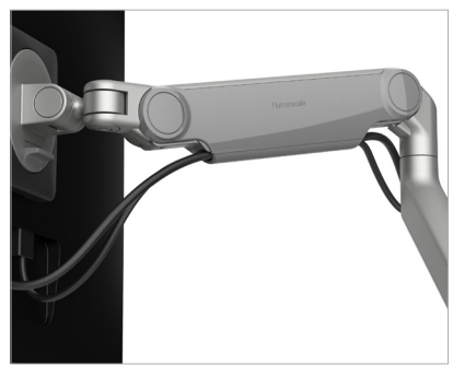
Easy Install Cable Management