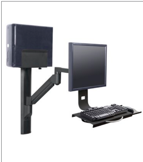
Add any Innovative LCD and/or keyboard arm—all of which can be moved out of the way when not in use