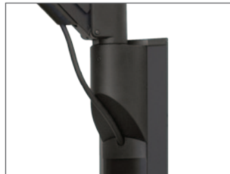
Cables are neatly routed through the track