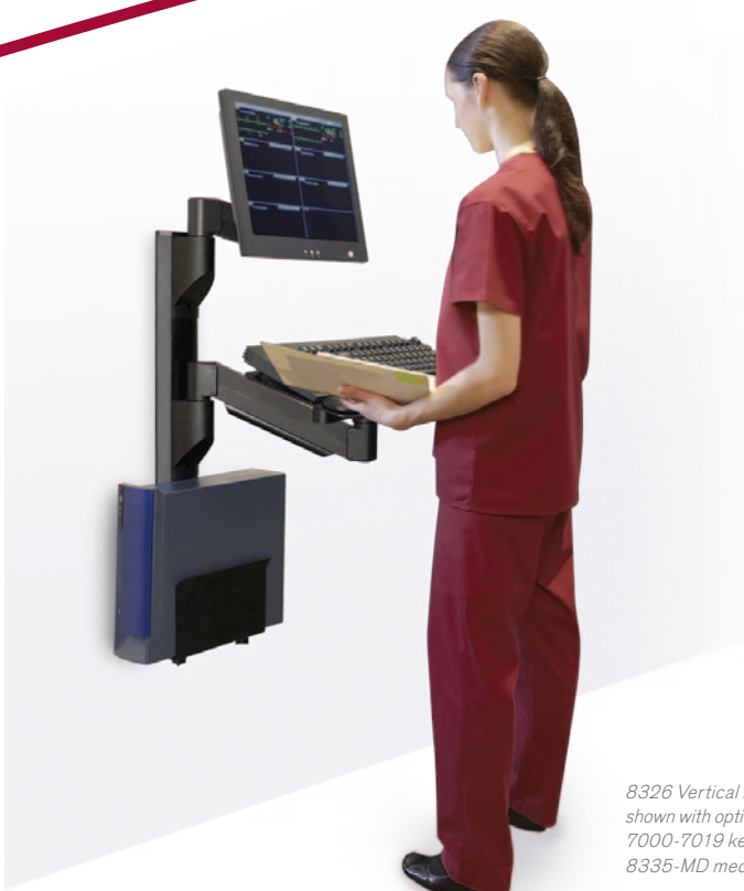
8326 Vertical Mounting Track shown with optional 7000 LCD arm, 7000-7019 keyboard arm and 8335-MD medium CPU holder.

The 8326 Vertical Mounting Track provides an extremely space-efficient method of elevating your entire computer system. This configurable solution can be customized to meet your needs—incorporate flexible LCD arms, keyboard arms, even a CPU holder. Cables are routed through track, and hidden behind a cable channel.