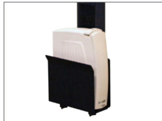
Optional CPU holder elevates your CPU to save space