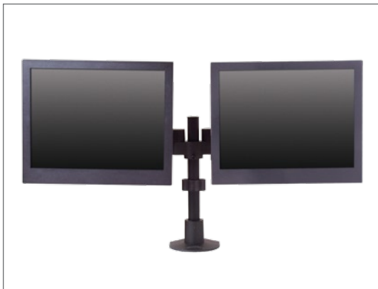
Suspend two monitors side-by-side