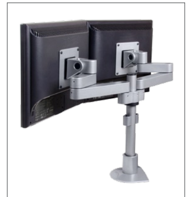
Folds into 3" of space