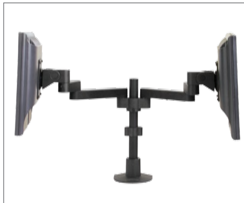
Configures to serve multiple users