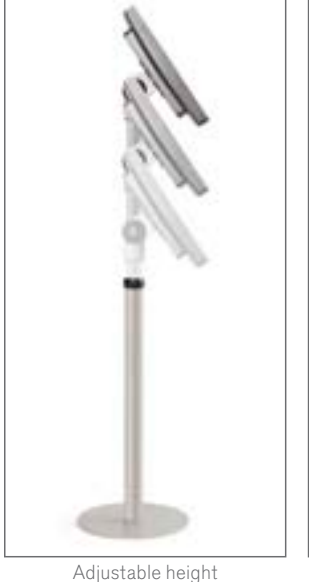
Internal cable routing