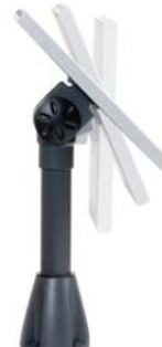
Tilt tablet to desired angle