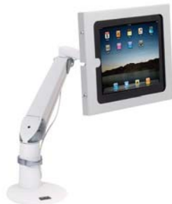
Easily rotate tablet from portrait to landscape