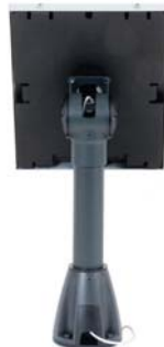
Keep cables safe and out of harms way with internal cable management