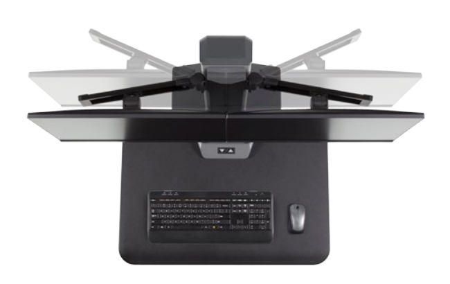
Focal depth adjustment allows users to easily position monitors to a comfortable viewing distance.