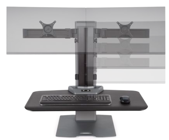
Independent movement of the monitors lets users keep each monitor at a comfortable, ergonomic level.