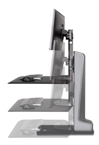
Electric height adjustment makes going from sitting to standing effortless.