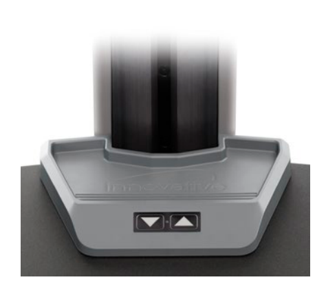
Programmable height adjustment, so the workstation always rises to the right position with a single touch.