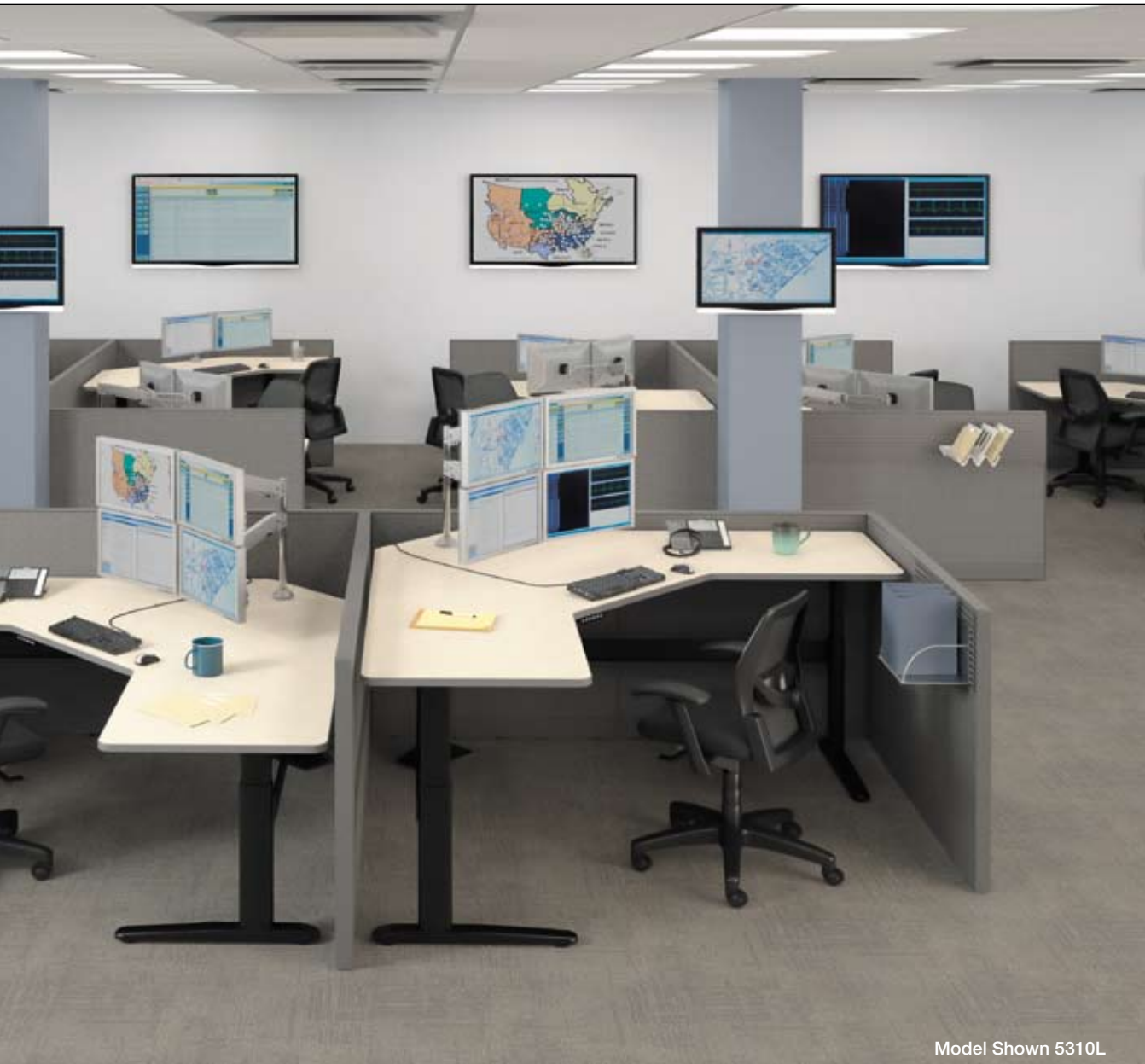
Model Shown 5310L