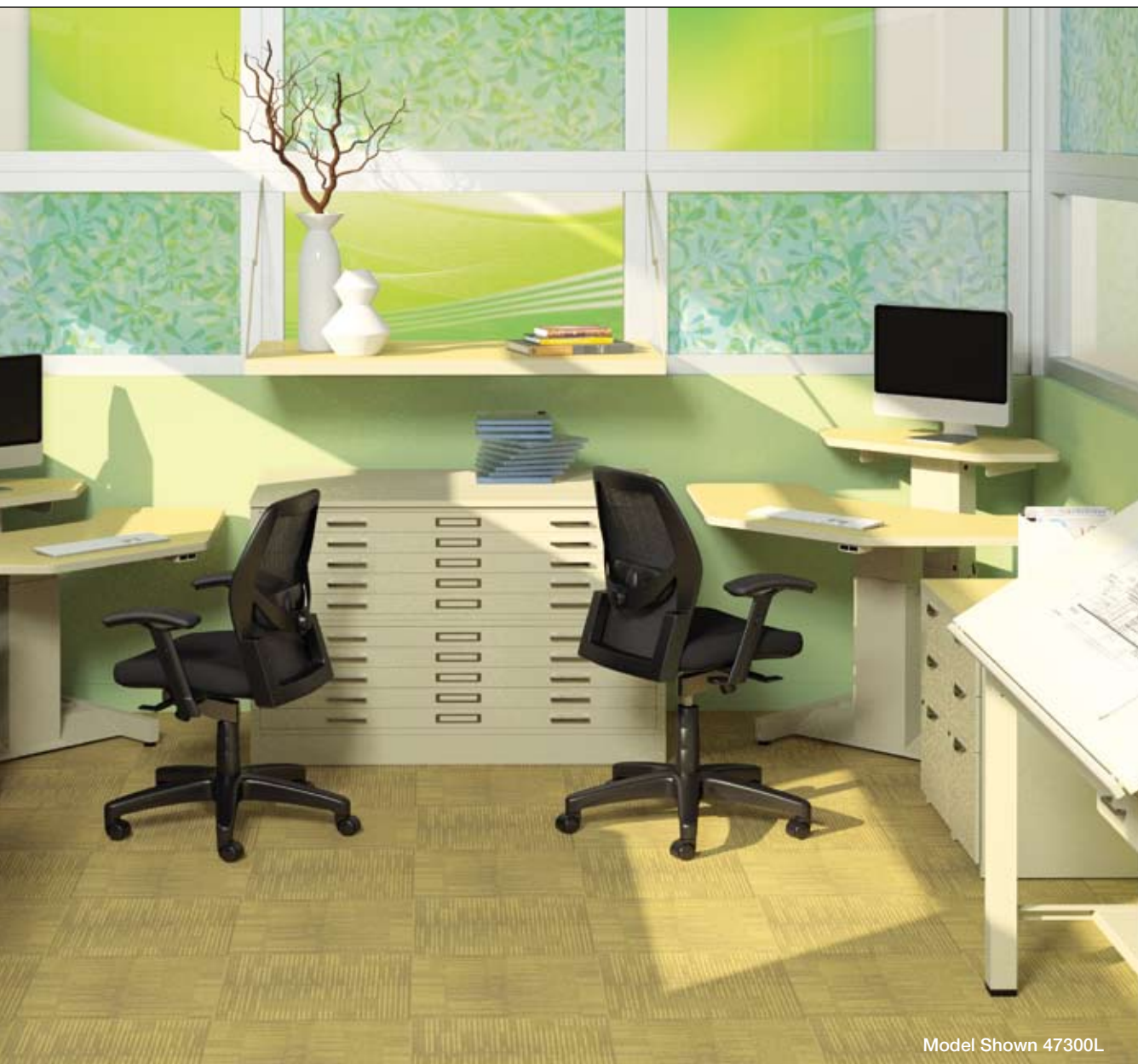
Model Shown 47300L