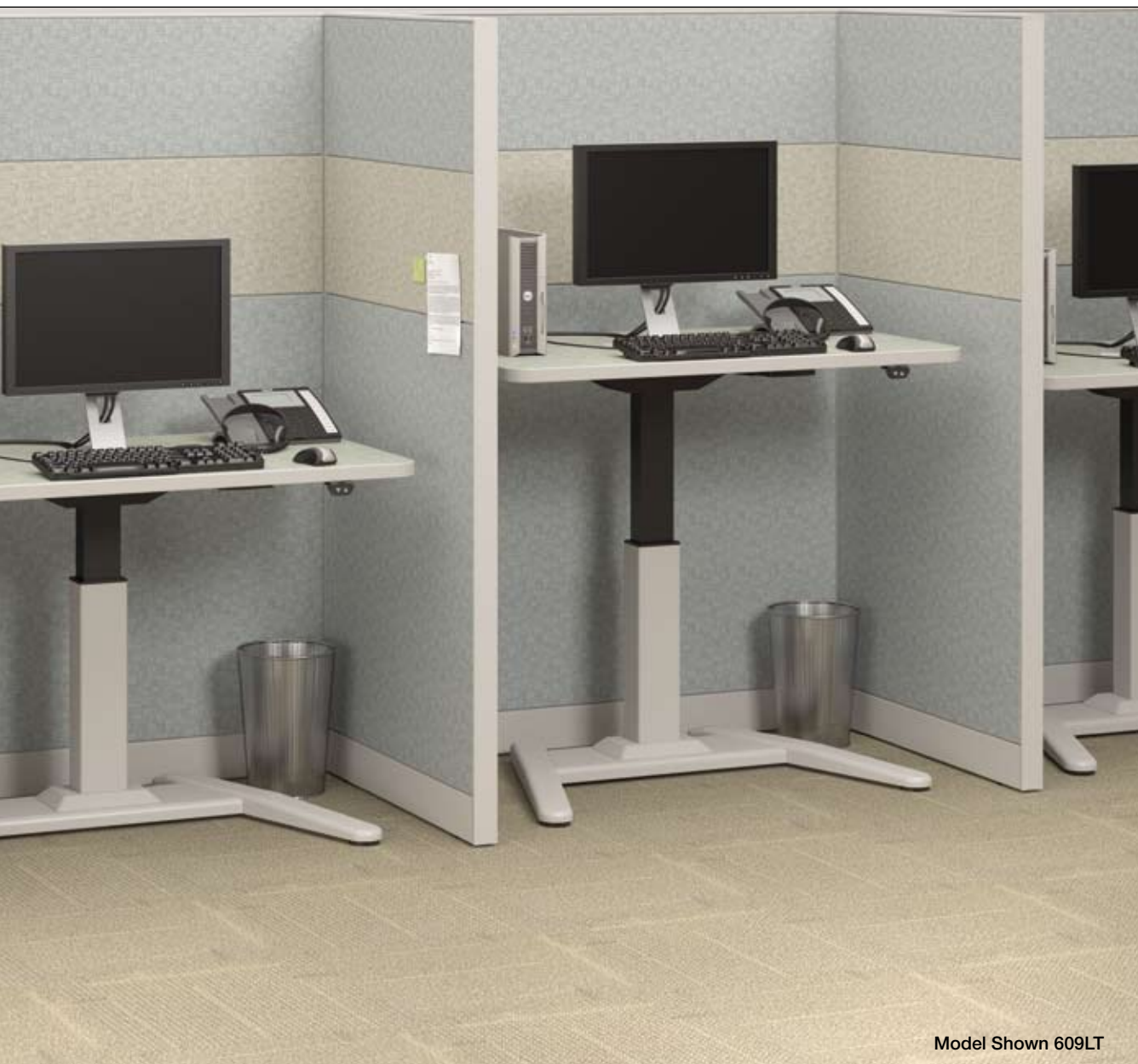
Model Shown 609LT