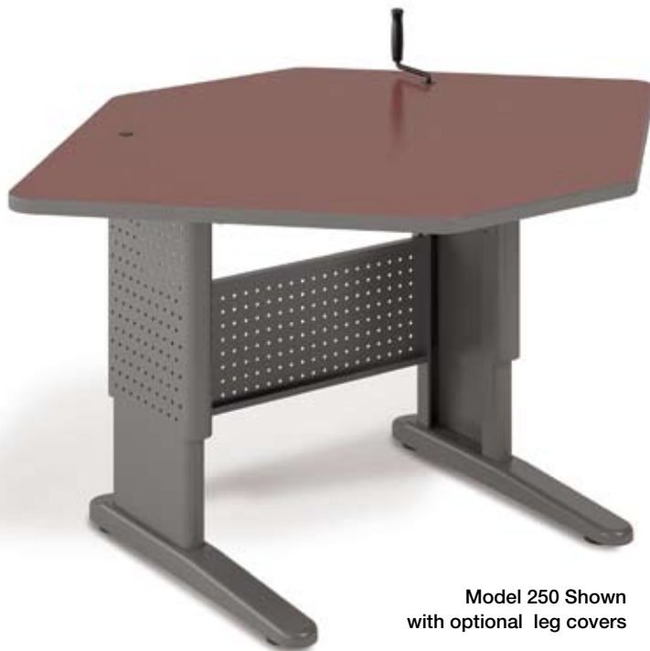
Model 250 Shown with optional leg covers

For the cost conscious customer , VariTask Basic provides our most affordable height adjustable solution while still maintaining all the advantages of ergonomics.