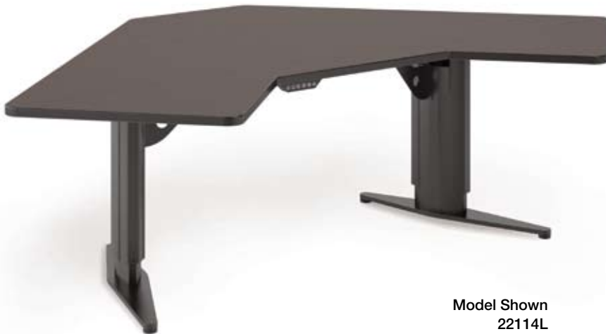
Model Shown 22114L