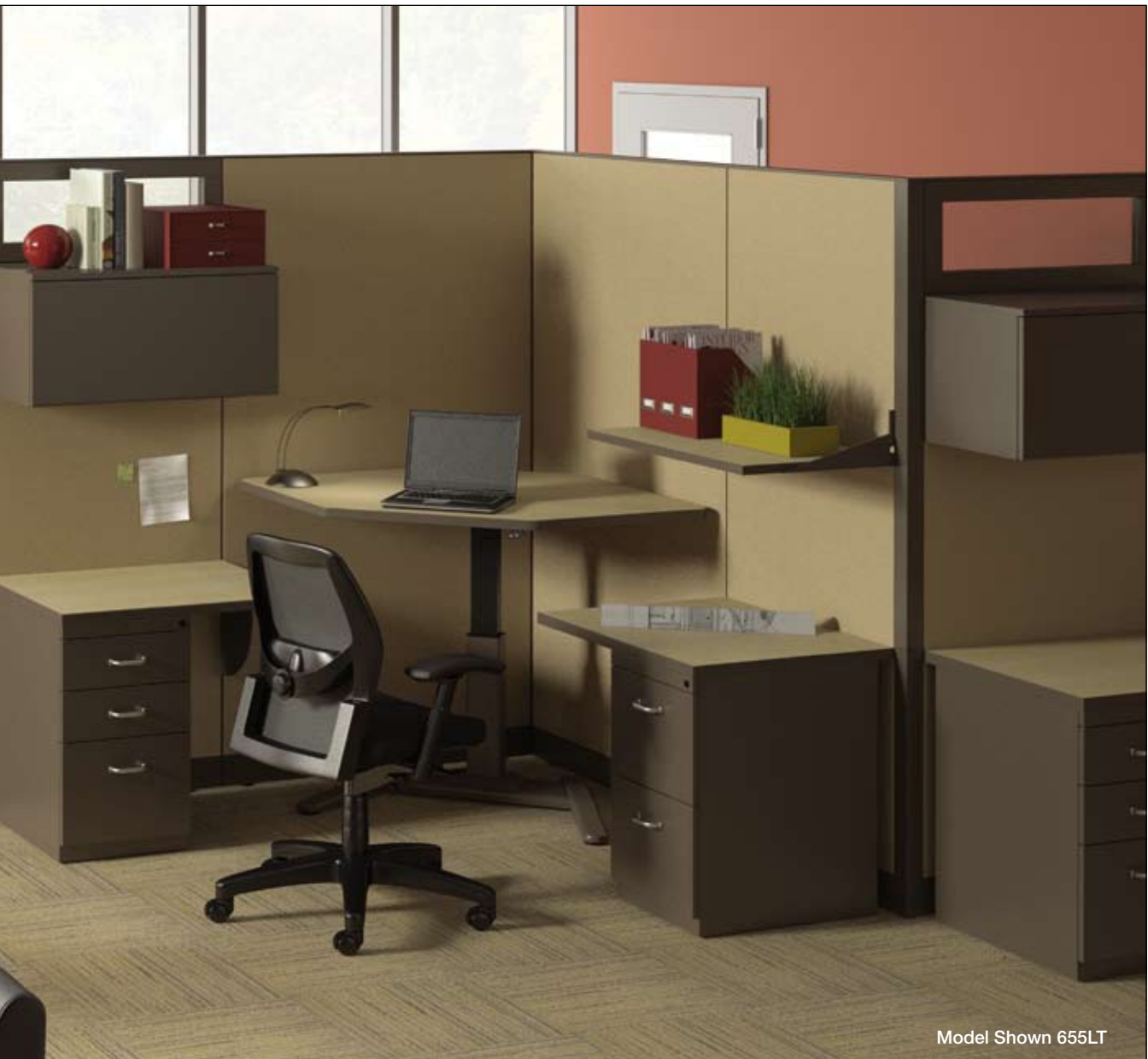
Model Shown 655LT