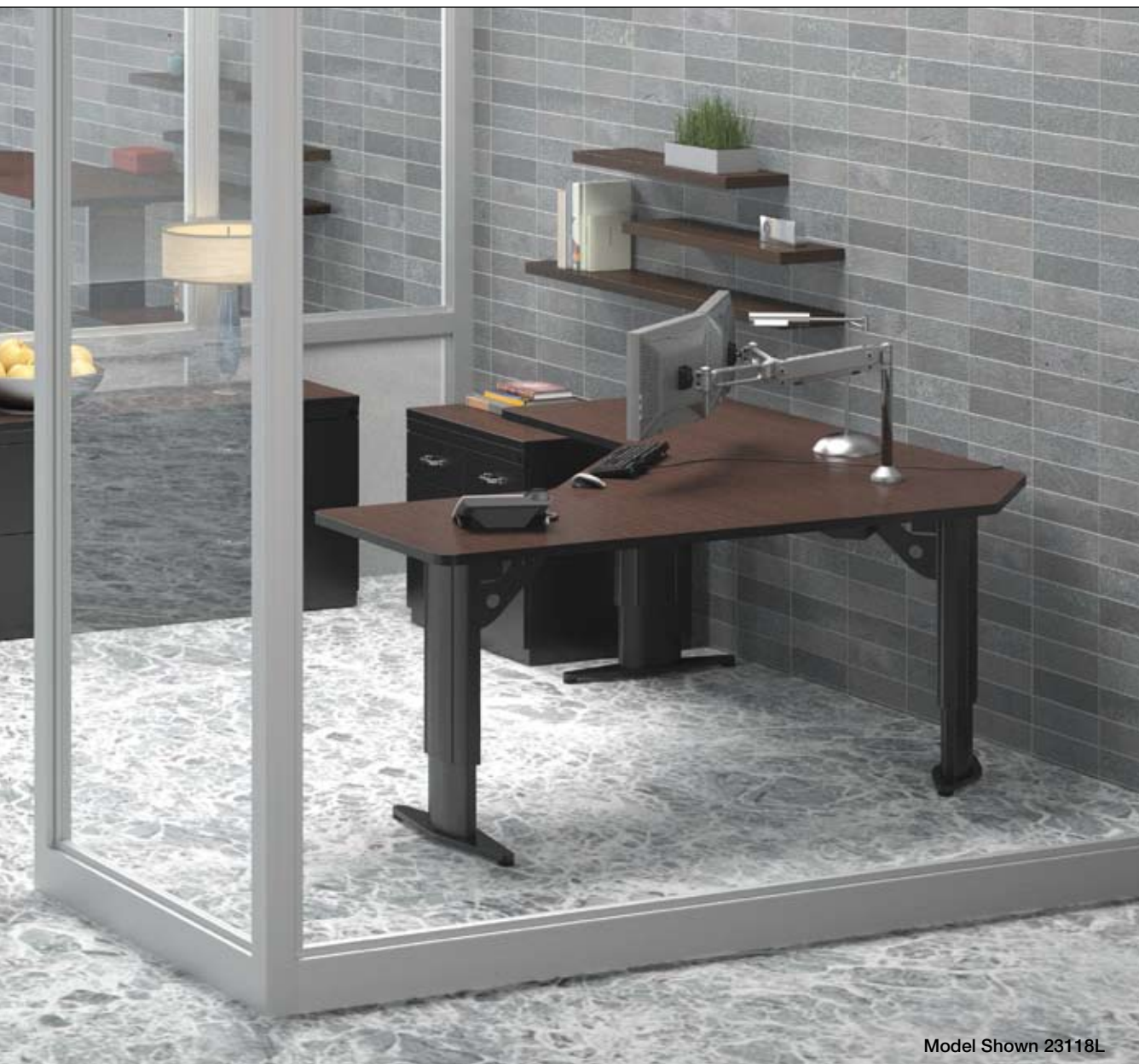
Model Shown 23118L