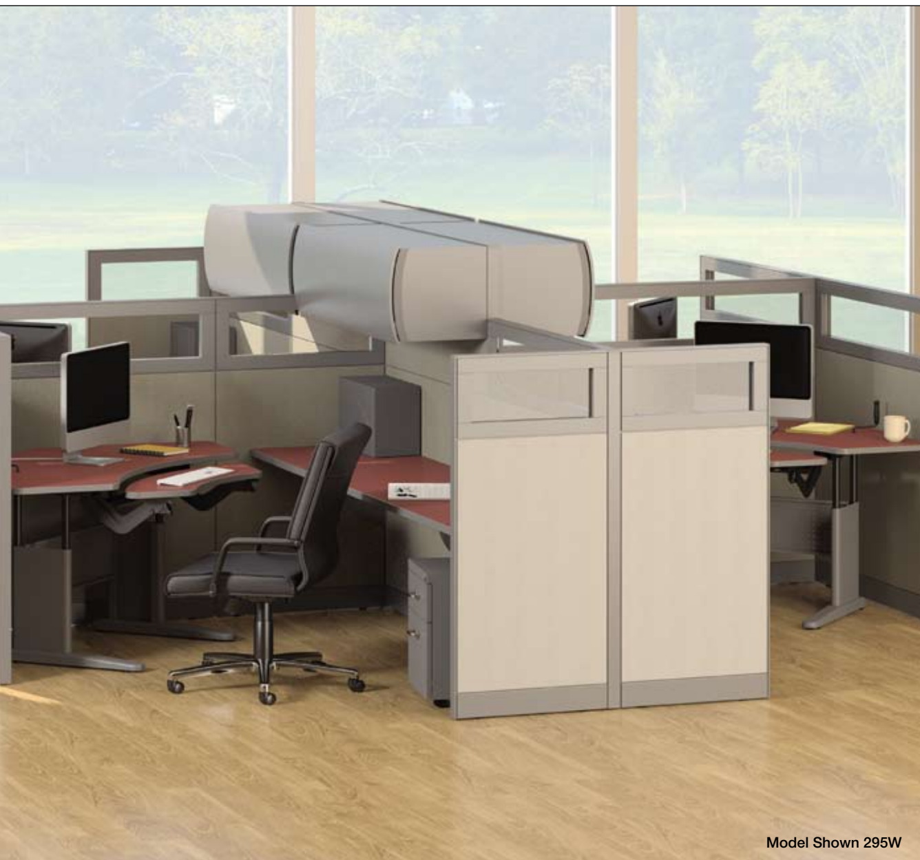
Model Shown 295W