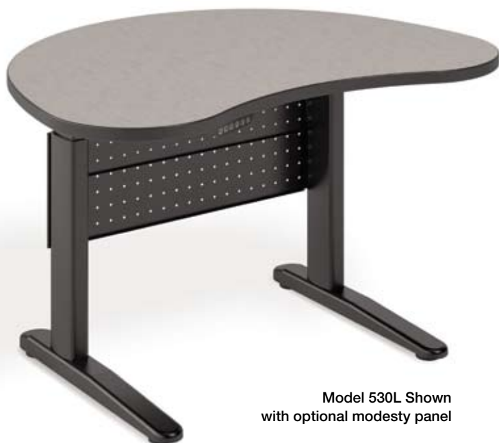
Model 530L Shown with optional modesty panel