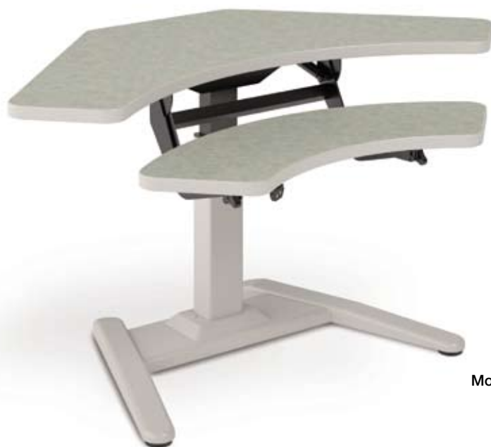
Model Shown 685LTW