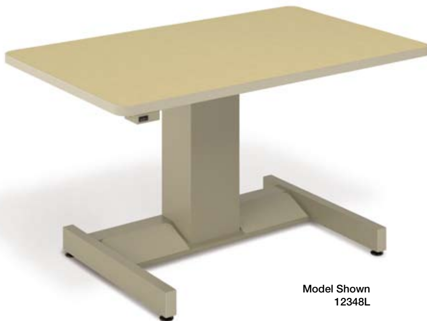
Model Shown 12348L

With the simple push of a button, VariTask Classic reduces stress and strain on the neck, shoulders and back by allowing users to continue working, yet alternate positions throughout the day.