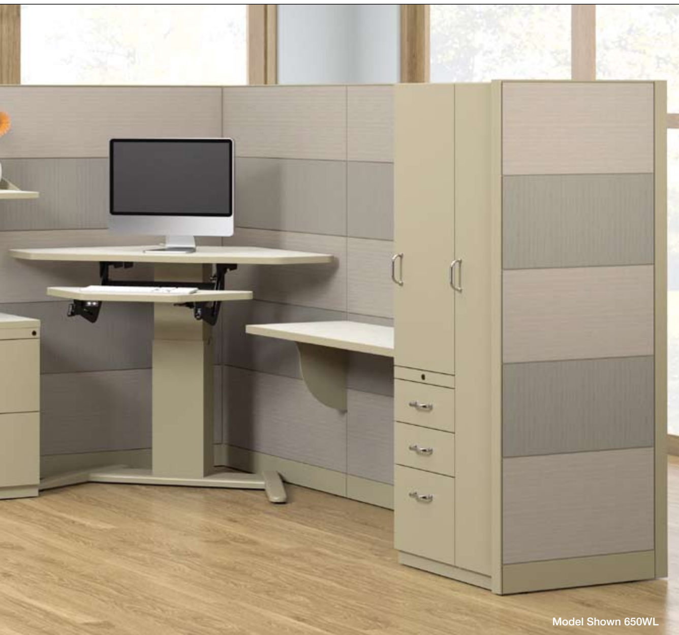
Model Shown 650WL