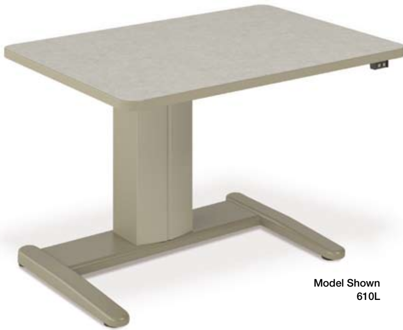
Model Shown 610L