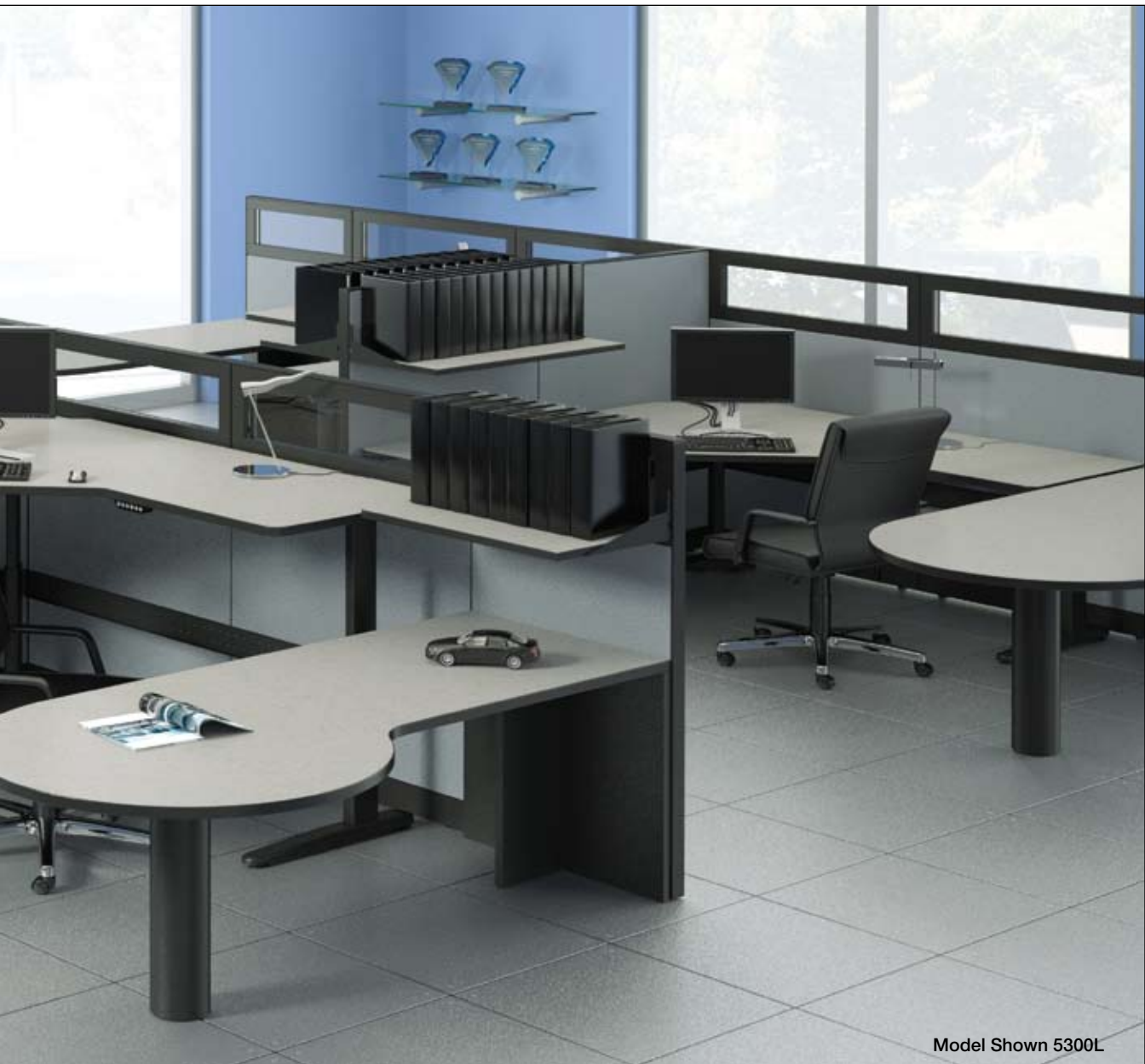
Model Shown 5300L