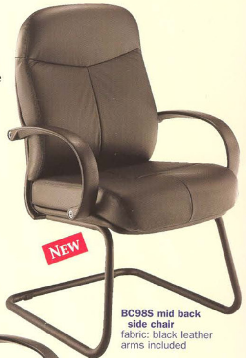
BC98S mid back side chair fabric: black leather arms included

This series also offers an unprecedented combination of fine craftsmanship and personal seating comfort in rich leather at a reasonable price. The elegant, sumptuous cushioned seat cradles your every move, and the lumbar support cushion conforms to your lower and upper back contours for a "customized" fit.