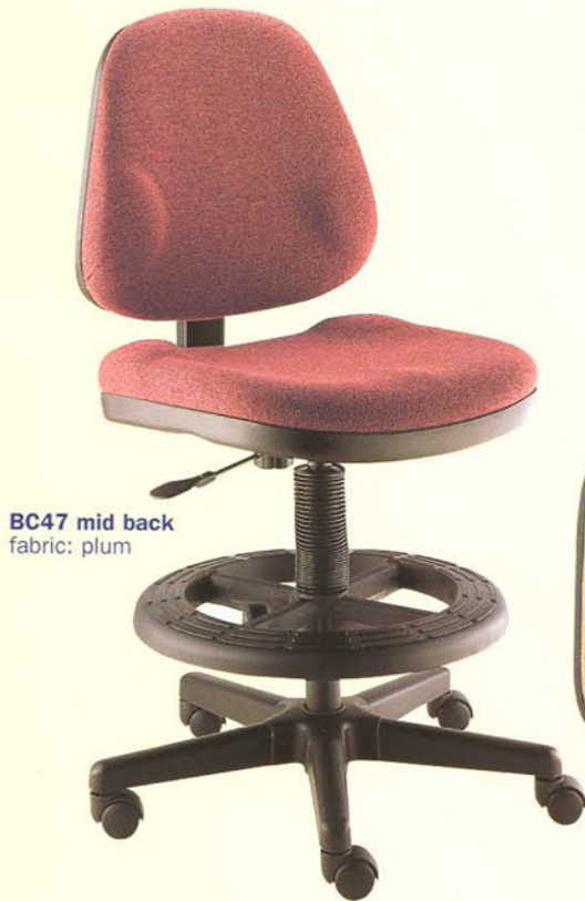
BC47 mid back fabric: plum

Each chair is engineered and manufactured to the highest standards. Construction features backrest vertical lumbar support and a beautiful sculptured contoured indented molded foam seat and back. Each model also includes pneumatic seat height adjustment, specially designed 5-star shell base with hooded casters, and optional contour-molded arms.