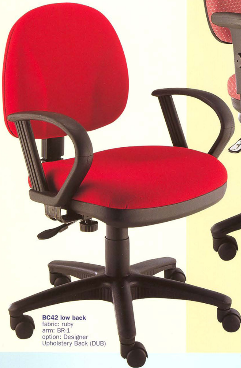
BC42 low back fabric: ruby arm: BR-1 option: Designer Upholstery Back (DUB)