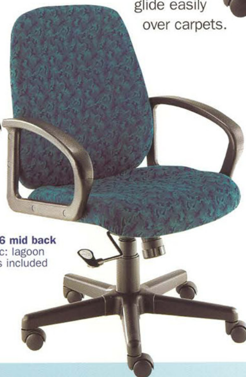
BC86 mid back fabric: lagoon arms included

A new low back choice in the BC Executive Series, the BC85 is stylish and smooth riding.