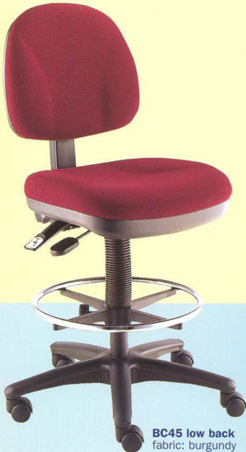
BC45 low back fabric: burgundy