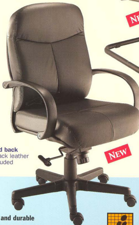
BC98 mid back fabric: black leather arms included