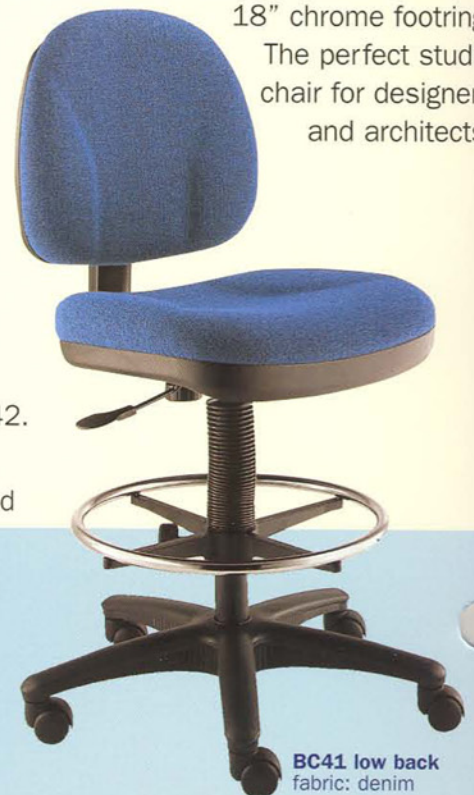
BC41 low back fabric: denim

BC41 is the drafting stool version of BC42, with an 18" chrome footring. The perfect studio chair for designers and architects.