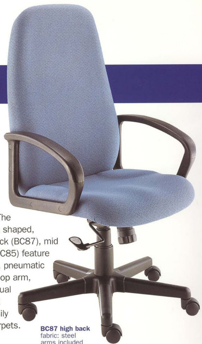
BC87 high back fabric: steel arms included

wheel hooded casters that glide easily over carpets.