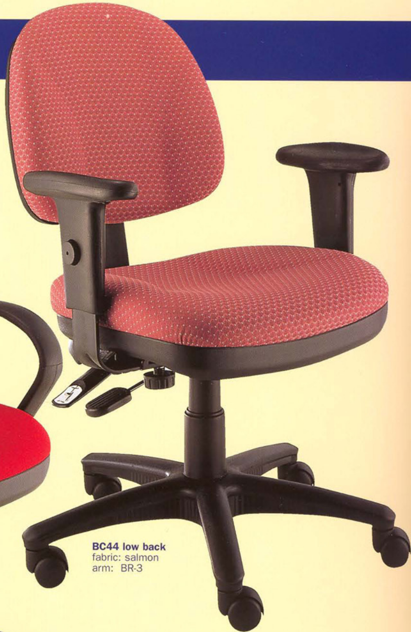
BC44 low back fabric: salmon arm: BR-3