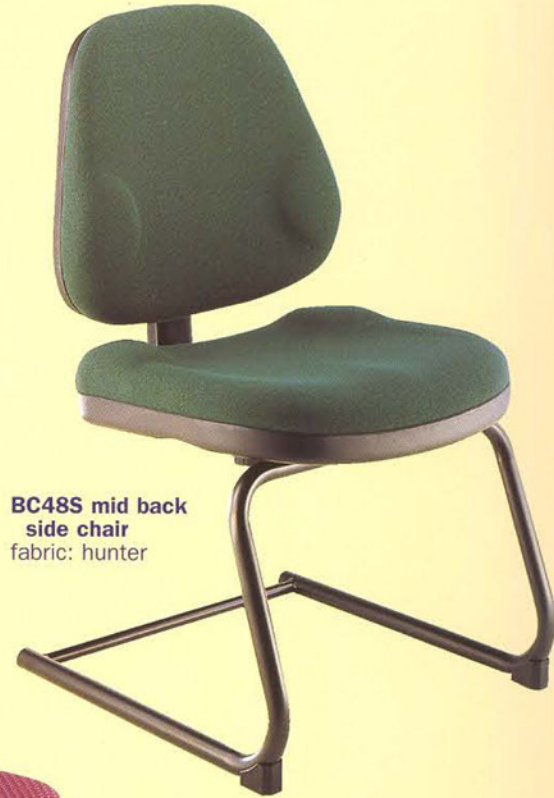
BC48S mid back side chair fabric: hunter

BC48S is a cantilevered sled-base side chair.