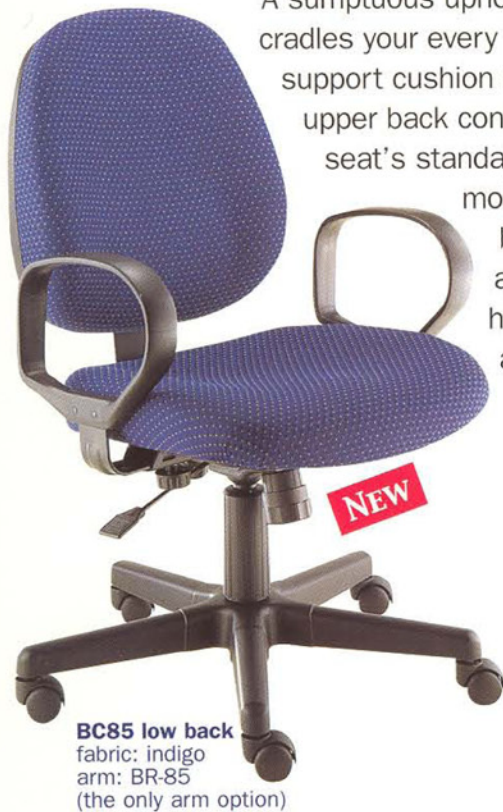
BC85 low back fabric: indigo arm: BR-85 (the only arm option)

A new low back choice in the BC Executive Series, the BC85 is stylish and smooth riding.