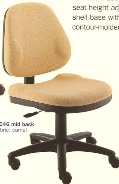
BC46 mid back fabric: camel

BC46 is the mid back version of BC42. It has the same functions as BC42, but with a larger, sculptured contoured HR seat and back.