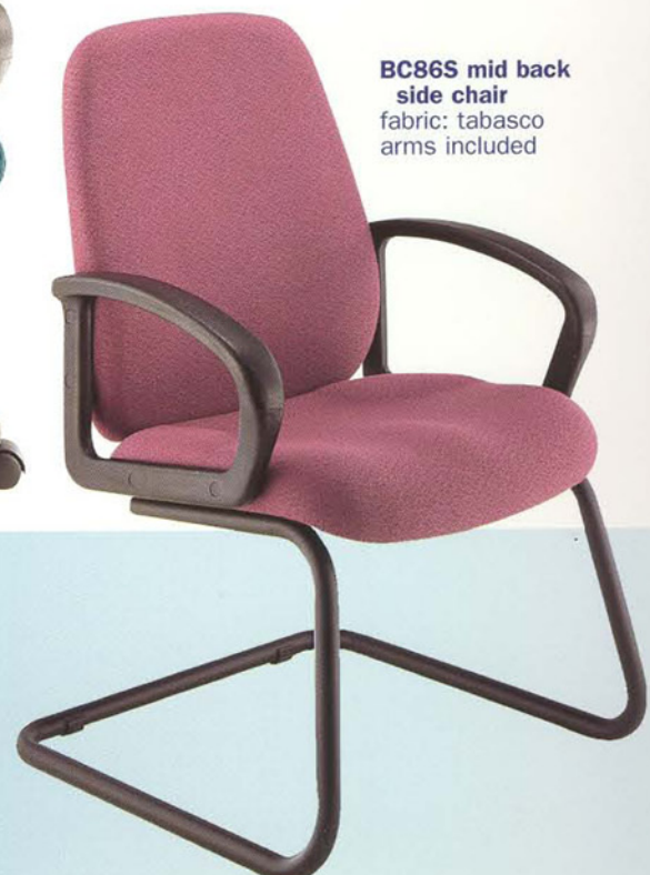
BC86S mid back side chair fabric: tabasco arms included

To give your visitors the same comfort, add our BC86S cantilevered sled base side chair with integrated arms. The seat, back and arms are supported by a strong steel frame which is finished with a power-coated enamel for durability.