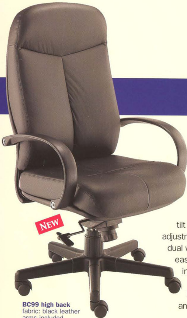
BC99 high back fabric: black leather arms included

Both high and mid back chairs feature a simple knee tilt with lock, pneumatic height adjustment, and 5-star wide base with dual wheel hooded casters that glide easily over carpets. The series includes top grain leather on seating areas and matching black vinyl on the posterior and underside areas.