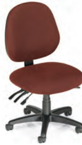
PA57 Task Chair

Pneumatic lift Tilting backrest EZ back height adjustment Seat tilting Sliding seat