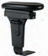
KR-251M Memosoft arm pads Ultra mobility arms with extension

Pneumatic lift Tilting backrest EZ back height adjustment Seat tilting Sliding seat Fabric panel back