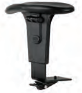
KR-240 Contoured arm pads Lowest height and width adjustable