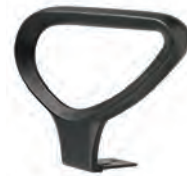
KR48 Loop arms Fixed position

KR-251M Achieve ultimate versatility by choosing this arm with maximum adjustability to move the arms close to the body or with you as you work.