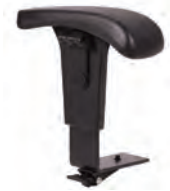
KR-300 Contoured arm pads Tallest height and width adjustable