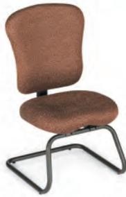
PA61S Guest Chair

Pneumatic lift Tilting backrest EZ back height adjustment Seat tilting Sliding seat