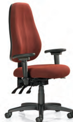
PA59 SHOWN WITH JR-40M ARMS