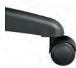
Reverse Braking For smooth surfaces, locks when user is seated.