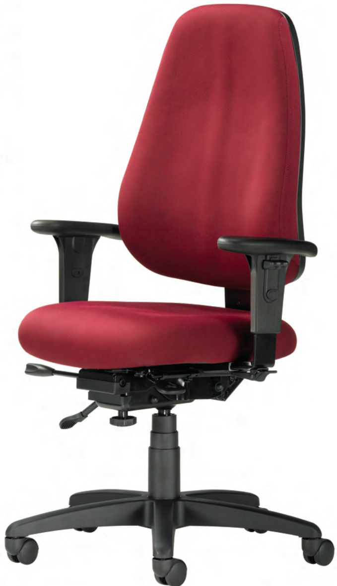
PC59 SHOWN WITH KR-240 ARMS