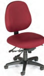
PC53 Task Chair