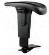
KR-200 Contoured arm pads Height and width adjustable