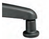
Glider For any surface, keeps chair or stool stationary.

Pneumatic lift Tilting backrest EZ back height adjustment Seat tilting Sliding seat Rocking tilt Infinite forward tilting Tension knob Fabric panel back