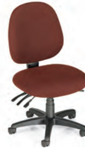
PA58 Management Chair

Pneumatic lift Tilting backrest EZ back height adjustment Seat tilting Sliding seat