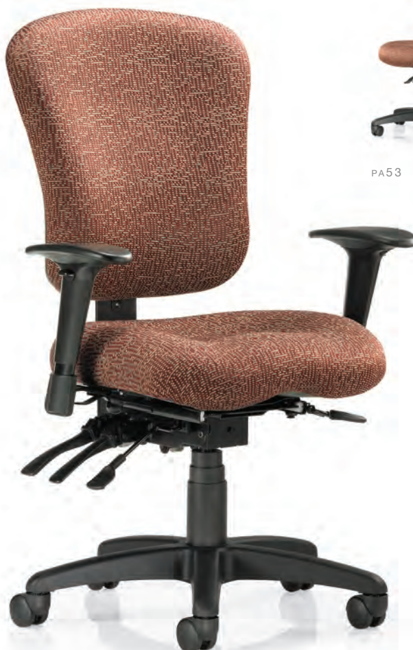
PA55 SHOWN WITH JR-37 ARMS