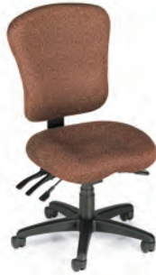
PA55 Management Chair

Pneumatic lift Tilting backrest EZ back height adjustment Seat tilting Sliding seat