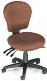
PA53 Task Chair