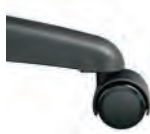
Self Braking Safety For smooth surfaces, restricts rolling when user is not seated.