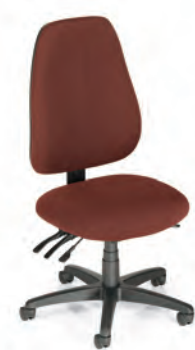
PA59 Executive Chair

Overall width 26.5" Overall height 43.5-51.5" Back 20.5"w x 25"h Seat 22"w x 18.5-21"d Seat height 17.5-22.5" Warranty 12 year limited