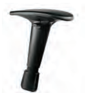
JR-37 Forward slanting Height and width adjustable