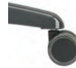
Dual Color Soft Caster For any surface, reduces surface marking.