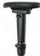
JR-40M Finger grip, Memosoft armpads Four way adjustable