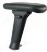
JR-50 Forward slanting Maximum mobility arm top