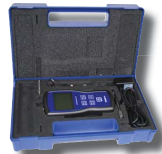
FG-7000 with Accessories in Protective Carrying Case