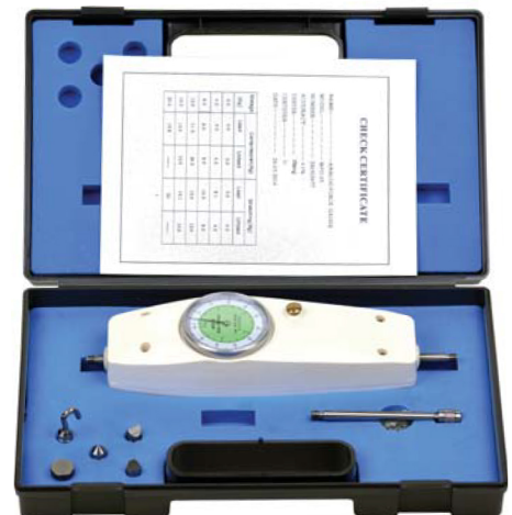
MFD in Standard Carrying Case