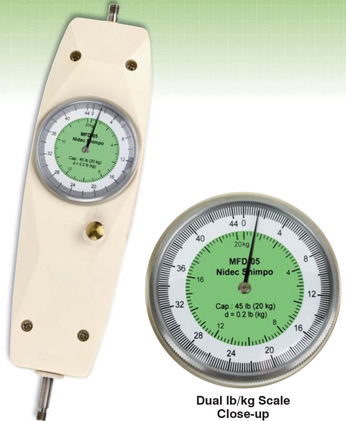
Dual lb/kg Scale Close-up

So simple anyone can use, the economical MFD mechanical force gauges with dual kg/lb scales are excellent for push/pull force testing in manufacturing, material testing, maintenance and inspection applications. The peak force operation mode features an easy push-button reset, especially helpful for repetitive testing in an assembly line or in quality control. The large dial indicator allows viewing of force changes as they occur. This large dial reduces the chance for parallax errors when taking readings. The MFD was ergonomically designed for handheld use, but may also be used with the optional handle-great for loads over 15 pounds (6.8 kg). Due to its mechanical design, response time is immediate. Calibration is achieved by a set of precisely matched springs which are overload protected. All standard Series MFD gauges include a protective carrying case, calibration certificate, plus attachment adapters.