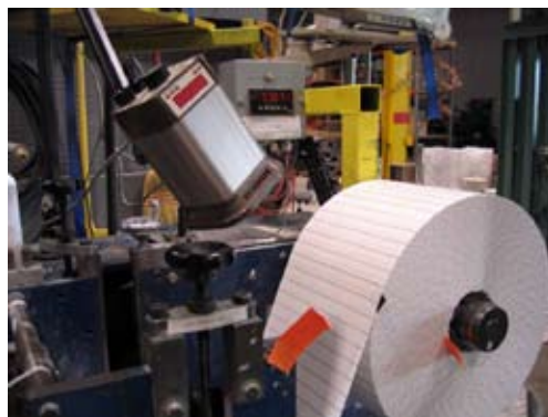
DT-315A Viewing Labeling Machine