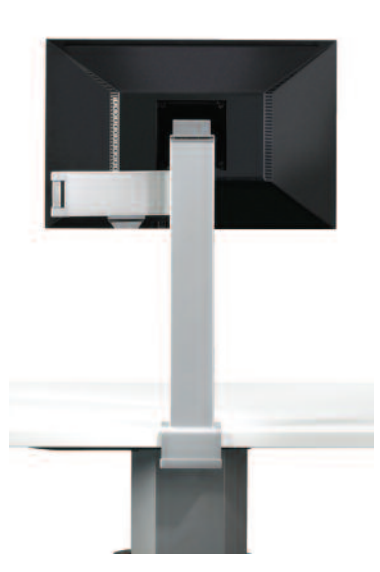
18" Extended Column

On-center mounting for straight forward or straight back movement enables the arm to glide across a 13" range of focal depth adjustment while maintaining monitor alignment. And it tucks flat neatly against a panel or wall so valuable work space is re-claimed right where it's most needed: directly in front of you!