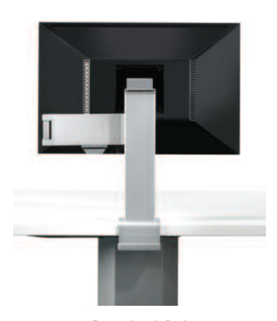
12" Standard Column