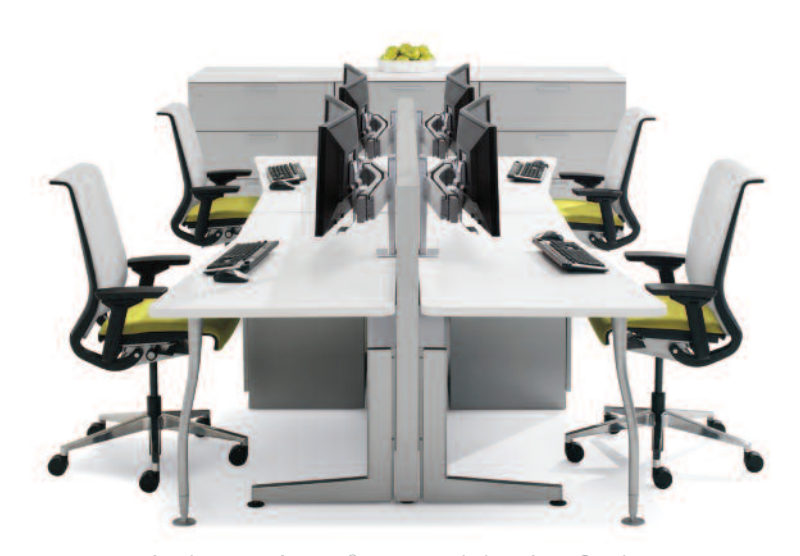
As shown on Answer® system solutions from Steelcase.