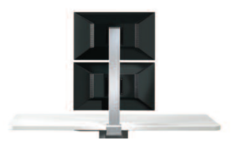
Eyesite static one-over-one display support, C-clamp FPAS101CC