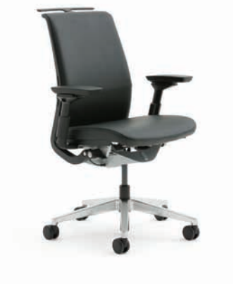
*Optional Coat Hanger