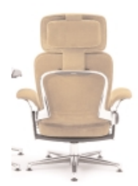
464 Leap WorkLounge standard with glides

The cushioned Ottoman quickly converts into a functional worktable. It may be ordered with Leap WorkLounge, or separately for use with any chair.